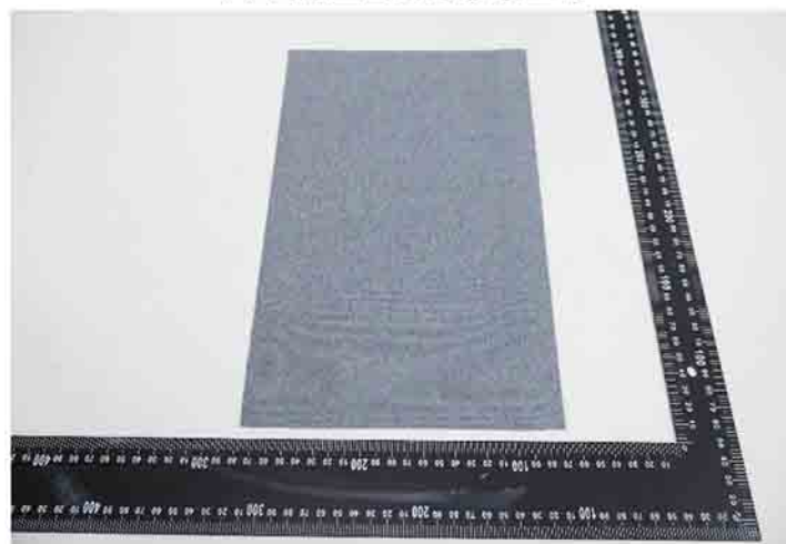
Appearance of the sample-Back view