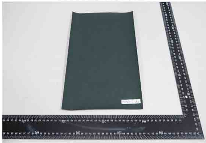
Appearance of the sample-Front view